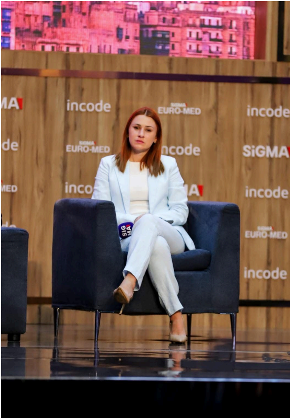
At SiGMA Malta · on the Euro-Med panel on Mediterranean innovation and digital infrastructure, 2025.