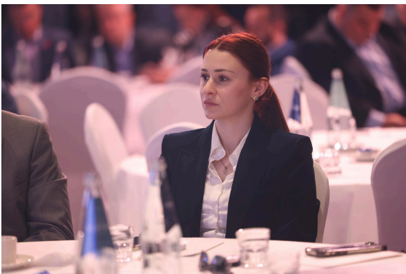
Business Breakfast · Ta' Qali, April 2026 · addressed by Prime Minister Robert Abela.

Malta Vision 2050 was never an anti-development exercise. Its purpose is to guide Malta toward a more sustainable, resilient and wellbeing-oriented future while preserving economic strength, competitiveness and social mobility.