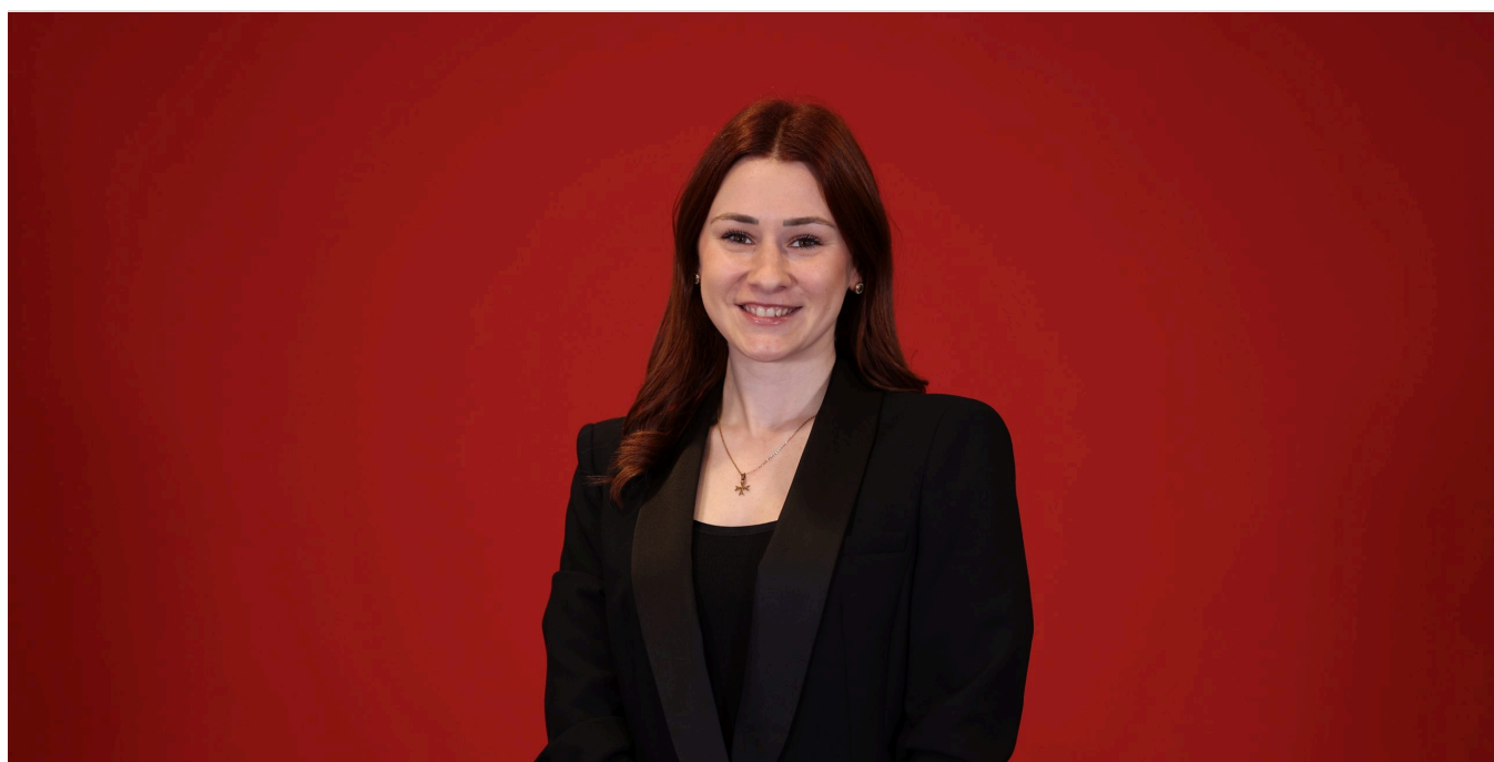
COVER PHOTOGRAPH · CRESSIDA GALEA, OFFICIAL CAMPAIGN PORTRAIT, 2026.

BY CRESSIDA GALEA · MEMBER OF PARLIAMENT, ECONOMIST · FOR THE 30 MAY 2026 GENERAL ELECTION